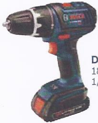
DDS181-02 18V Compact Tough™ 1/2" Drill/Driver

Get one of these three great tools FREE with the minimum purchase of $500 in BOTH product categories below