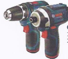
CLPK22-120 12V Max 2-tool Combo Kit